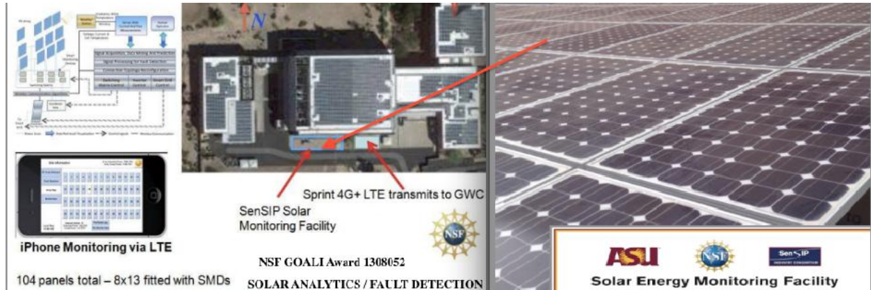
Figure 1. Solar 18kW 13x8 Panel Facility with Sensors and SMDs at ASU Research Park dedicated to NSF GOALI Award 1308052.