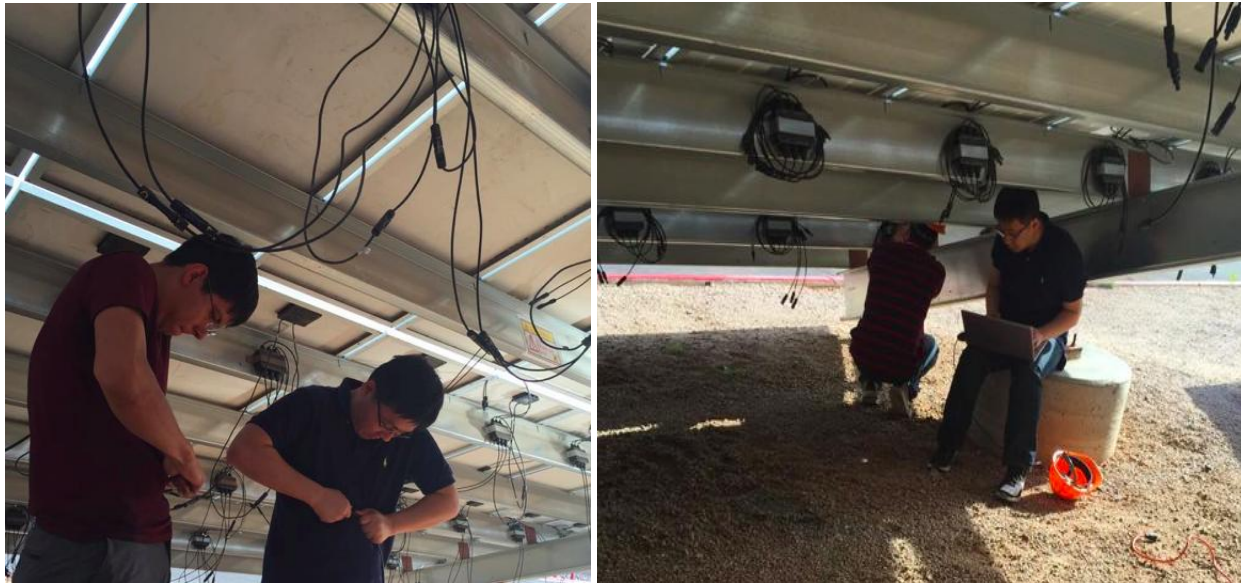
Figure 4. Installing and Programming SMD sensors on solar panels and obtaining analytics. In 2016-17 we will be simulating solar panel faults, shading conditions, and developing algorithms, and programming actuators to reconnect panels to maximize power. Davd Ramirez, Jongmin Lee and Sunil Rao. Scientific research results already reported in two products of NSF GOALI.